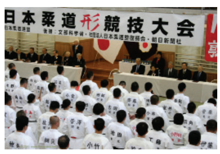
2009 Japan shoot, at the opening ceremony of the All Japan Judo Kata Tournament at the Kodokan in Tokyo