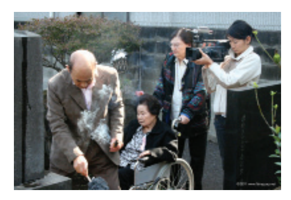
2009 Japan shoot, at the Tokyo cemetery paying respects to Fukuda's ancestors.

*Please note: All of the following photos can be downloaded in high-resolution on the film's website: www.Mrs.JudoMovie.com