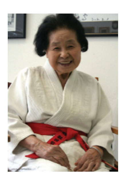
Smiling portrait of Keiko Fukuda