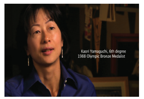
Kaori Yamaguchi 6th degree, 1988 Olympic Medalist

Kaori Yamaguchi is a 1988 Olympic bronze medalist in women's judo, and a former Japanese women's national team coach.