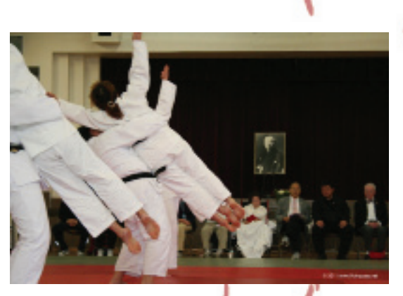
Kagami Biraki, Fukuda's annual judo New Year's celebration